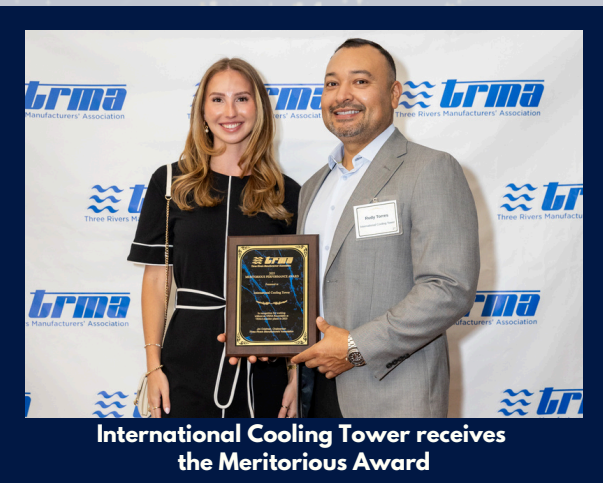
International Cooling Tower receives the Meritorious Award

One of the most notable accomplishments recognized during the evening was a combined OSHA Total Recordable Incident Rate of 0.331 among TRMA plants and contractors—a five-year low. This milestone reflects not only strong performance, but a deep-rooted culture of safety that continues to define TRMA members.