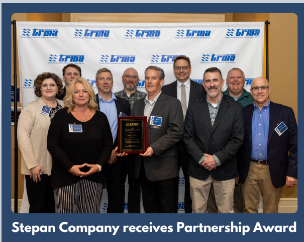
Stepan Company receives Partnership Award

The highlight of the evening was the recognition of safety achievements. Contractor companies, entrusted with operations within TRMA manufacturing plants, were commended for their outstanding safety practices. Despite the challenges encountered, 40 contractor firms received honors for their exemplary safety performance throughout 2023.