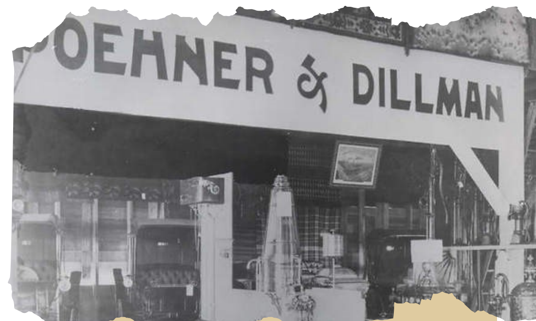
Poehner & Dillman known today as PDM