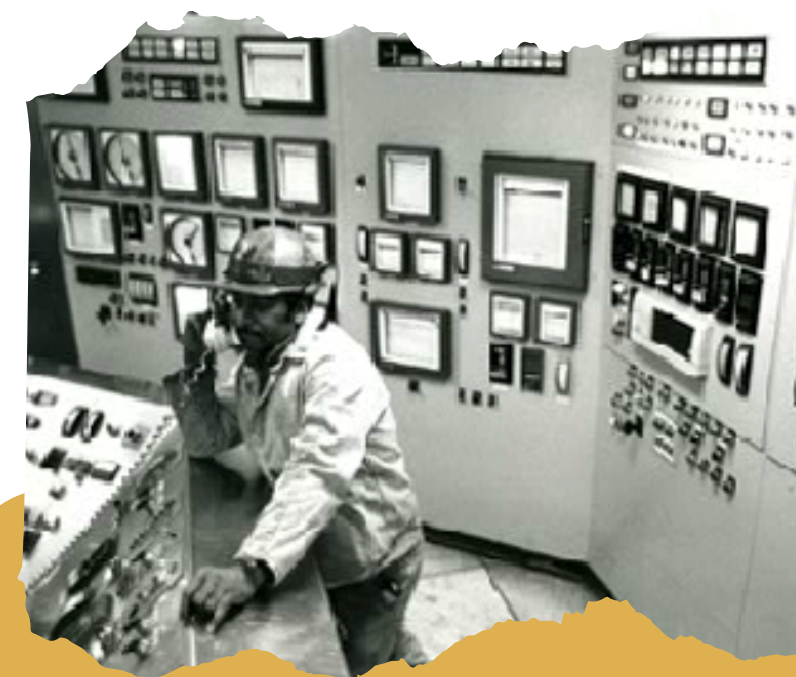
MEADE employee working on the Mobil Oil Expansion