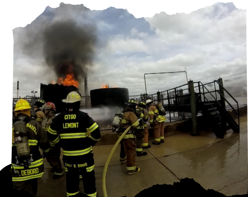
In the 1970s, two mutual aid response groups were established. The Three Rivers Spill-Coop aimed to prevent and prepare for accidental industrial spills in nearby waterways, while the NIAIMA group was created to prevent and plan effective responses to industrial fires and emergency situations.