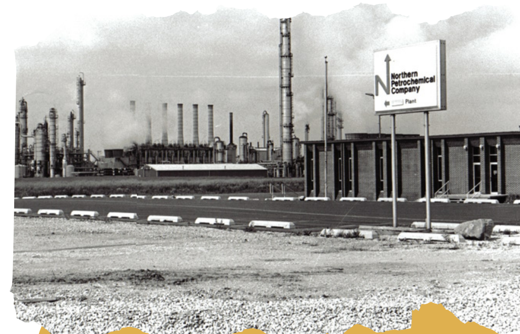
Northern Petrochemical Company (now LyondellBasell)