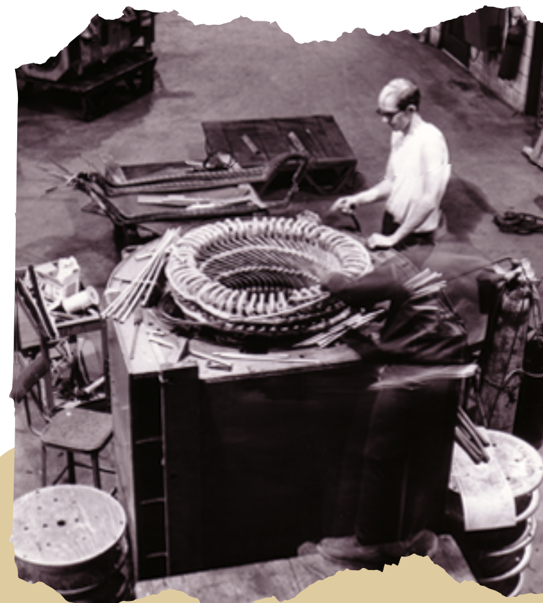
Joliet Electric Motors