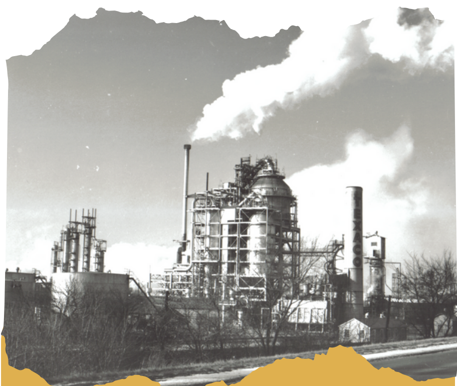
Pure Oil (now CITGO)