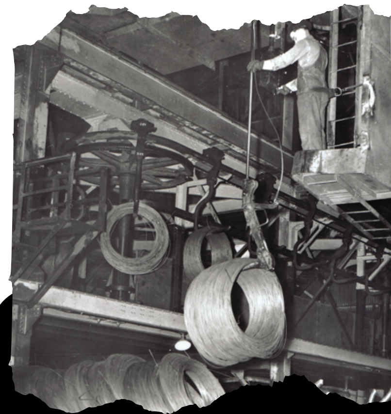
US Steel 1960