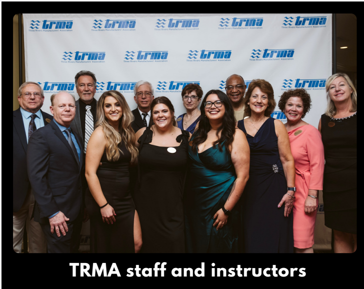
TRMA staff and instructors

Equally impressive is that many awardees worked all of 2022 without a single safety incident, achieving the ideal - Zero Incidents. We are very pleased to report that contractors worked 10 million hours in 2022 at TRMA member companies, & recorded an OSHA incidence rate of .37. TRMA manufacturing members prioritize safety; and their resulting safety culture is evident in their employees and their contracted workforce safety results.